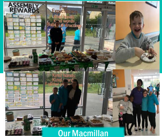
Our Macmillan Coffee Morning

Primary Pod welcomed families and carers to our Macmillan coffee morning, enjoying home made cakes, biscuits and hot drinks alongside raising money for charity.